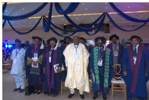
Nigeria Chapter Chairman with other Officials, Enugu (Nigeria)