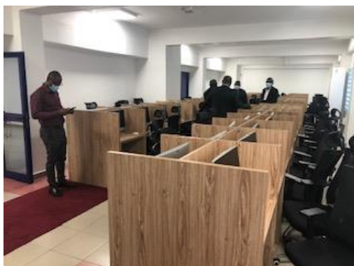
CBT hall, GCPS, Accra

New CBT center approved by Joint Admissions & Matriculation Board (JAMB), our main CBT partner at Ghana College for Physicians and Surgeons (GCPS) in Accra