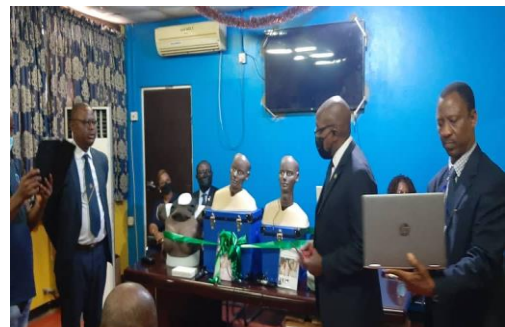
From left: Faculty Chair, PWACP, Chief Examiner