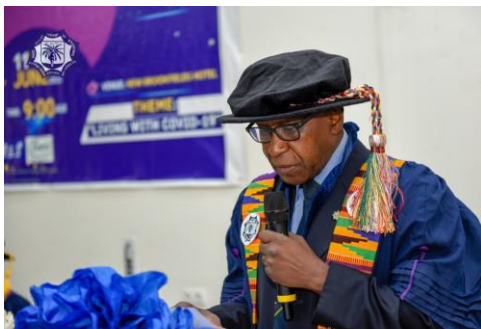
PWACP addressing Fellows in Freetown (Sierra Leone)

Local AGSM: Sierra Leone (Freetown), Nigeria (Enugu), Ghana (Accra), Côte d'Ivoire (Abidjan) have held their local AGSMs successfully.