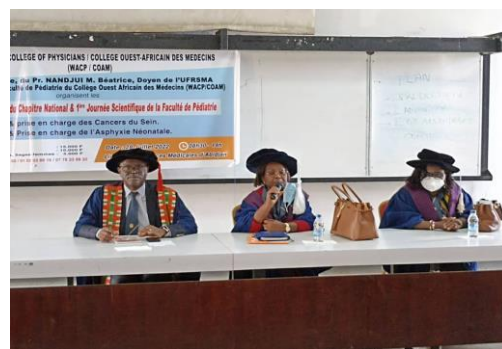
High table, Local AGSM, Abidjan (C. d'Ivoire)

New CBT center approved by Joint Admissions & Matriculation Board (JAMB), our main CBT partner at Ghana College for Physicians and Surgeons (GCPS) in Accra