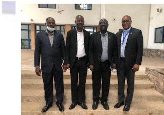
From left: JAMB officer 1&2, WACP SG, Vice rector GCPS