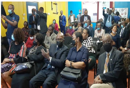
PWACP with EXCO members and examiners