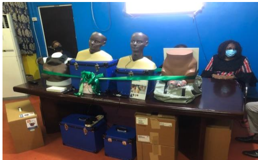
Photo of mannequins and other items

Faculty of Family medicine graciously donated mannequins for training and examination purposes. All the purchased items were commissioned by the President of WACP at a ceremony held in the Department of Family Medicine at UCH of Ibadan during the April exams.