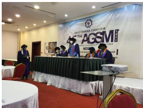
High table, Local AGSM, Accra (Ghana)