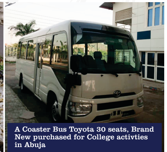
A Coaster Bus Toyota 30 seats, Brand New purchased for College activities in Abuja